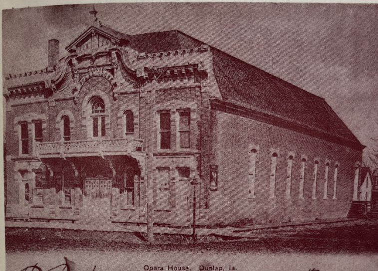
Opera House. Dunlap, Ia.