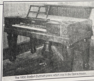
The 1832 Stodart-Dunham piano which was in the Opera House.

*from Dunlap Pioneers and Progress Centennial 1867-1967