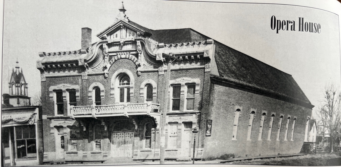
The Opera House was where the post office and parking lot are now. NE corner of Iowa Ave. and 8th Street.

What is known as the Dunlap Opera House was built in 1884, for the purpose of providing a skating rink for the town. Skating was a national mania at that time. But the builders, being foresighted, realized that the skating enthusiasm would be short-lived and also planned the building so it might easily be converted into an opera hall.