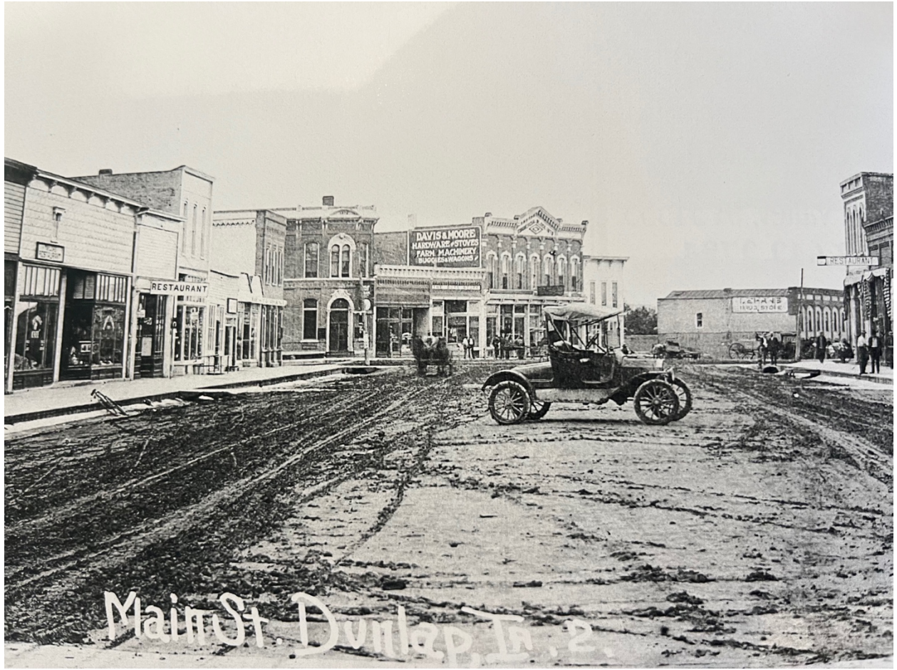
Main St. Duval, Ind.