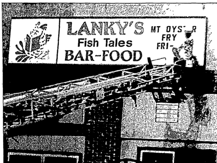
Work was completed last week on the Lanky's Fish Tales' illuminated sign.